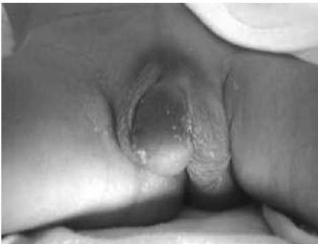
Figure 1. Ambiguous genitalia in a female with CAH

To date, there are no published data on the types of mutations present among Filipinos diagnosed with CAH. The objective of this study is to determine the disease-causing alleles in the 21-OH gene among Filipino patients diagnosed with CAH. Using a previously described combined differential polymerase chain reaction (PCR) and amplification created restriction site (ACRS) approach 9 , direct probing for the presence of known mutations in exon 1,3,4,6,7,8 and intron 2 of the CYP21 and CYP21P genes among Filipino patients with CAH was performed. The determination of the most frequent disease-causing alleles in our population can facilitate rapid screening for mutations in the 21-OH gene and lead to a definitive diagnosis of CAH. 10