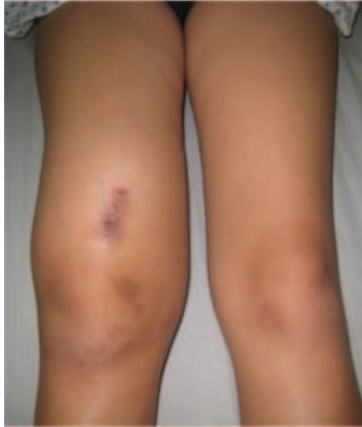
Figure 1. A painful mass around the knee is the most common presentation of osteosarcoma

necrosis for this group ranged from 15 to 70%, with most patients below 50%. The actuarial five-year survival estimate was 52% (95% CI) (Figure 5). All seven patients who remain alive have returned to or have graduated from school.