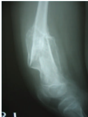
Figure 2. Pathologic fracture of the distant femur