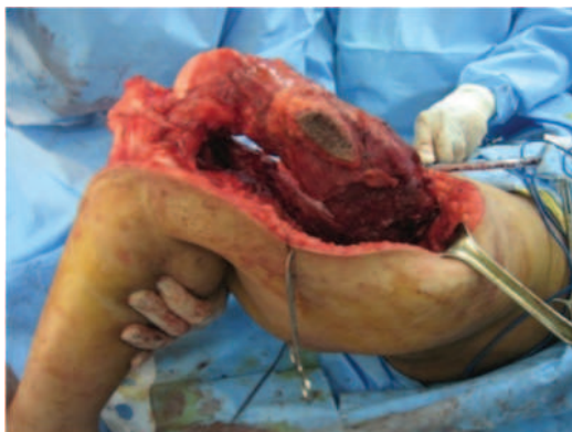
Figure 3. Wide excision of distal femur osteosarcoma