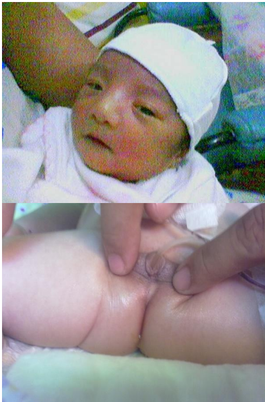
Figure 1 (A and B). The patient had a stubby nose, small mouth, high-arched palate, prominent occiput, micropenis with hyperpigmented skin around the urethral orifice, no palpable gonads (with permission).

The patient had a stormy clinical course which was marked by electrolyte abnormalities, pneumonia, sepsis and cardiorespiratory failure. On the 12th hospital day, the patient succumbed to septic shock.